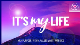
It's My Life