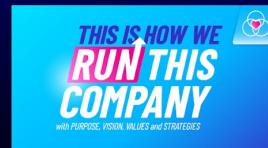
Run This Company

I get access to 10x Masterclass with videos, a workbook and a test for one year.