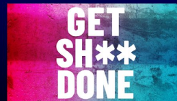
Get Sh** Done